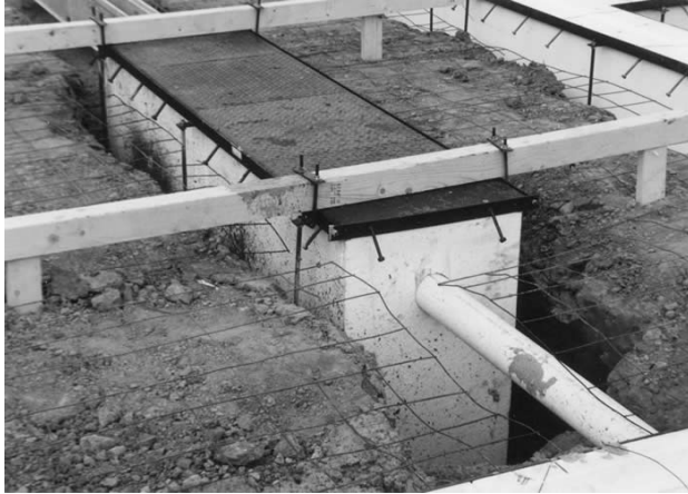
The Oil Water Separator , by ABT

Inc., unlike other separators, is a light-weight, easily installed forming system. Using our patented, non-floating formwork, the Oil Water Separator installs without the necessity of heavy equipment. It provides a cost-effective system of unequaled efficiency.