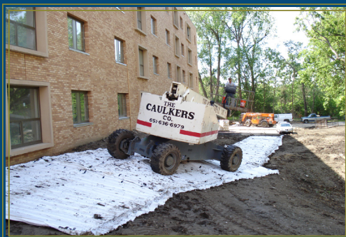
Poor Site Conditions