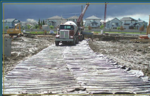
Alternative to Rock Entrance