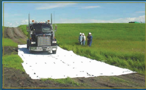
Crossing Sensitive Areas