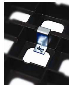
Figure 2 The PadLoc® Connection Device