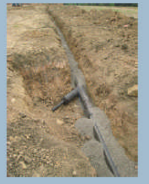
Methane Pipe Bedding/Seal