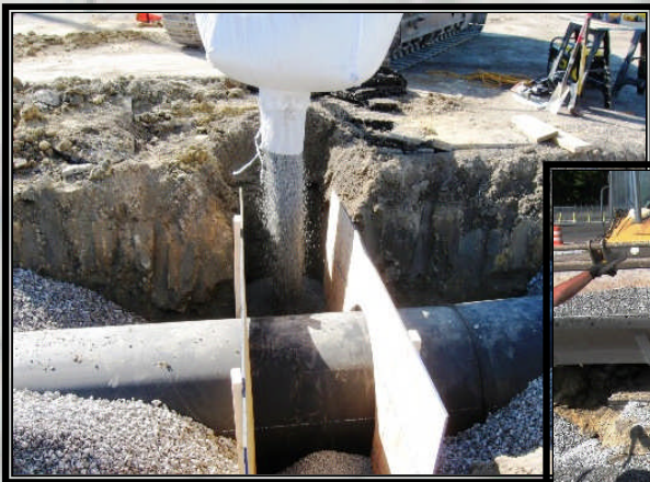
Trench Dam Installations ~ (for sewers and other utilities)

The unique physical attributes of AquaBlok – both in its dry and in its hydrated form – have proven to make it a highly versatile material for an equally diverse array of geotechnical applications. The base product's composition is simple: powdered sodium bentonite wrapped around a crushed stone core. But the variations – in the balance of clay and stone, particle size, and even treatment additives – allow for use in many settings and for many distinct purposes. The product is highly durable in that it “heals” if disturbed, withstands repeated freeze/thaw cycles, resists erosional forces, and re-hydrates an infinite number of times if exposed to prolonged periods of draught.