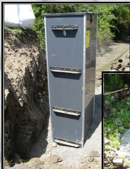
Control Structure Installations & Repairs ~ (see reverse for related anti-seep applications)

Once any void spaces are identified and all loose or permeable soils are removed around a failing structure, AquaBlok can be added as a simple backfill. No soil blending or mechanical compaction is necessary (reducing labor and installation costs). Because the product both swells and self-compacts, AquaBlok will naturally “key” into the soil around it – providing a tight seal.