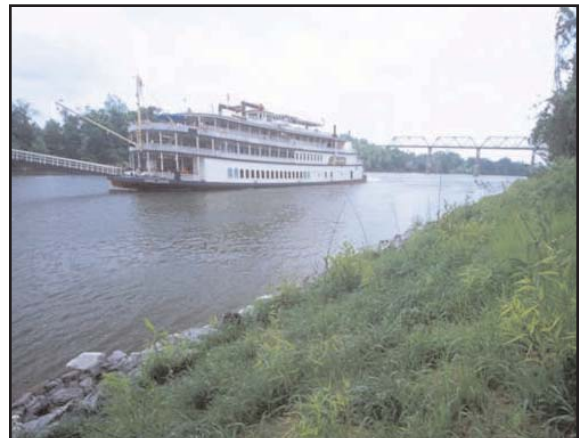
Intensive maintenance encouraged vegetation to become well established within one month (above), and fully established within three months (below).

The 100% biodegradable aspect of the C125BN lends itself well to all the engineered vegetation establishment methods used on this project. Its benefit was realized quickly when, two weeks after installation, on March 19th, flow velocity in the stream increased to 96% above its base flow and remained there for 36 hours. Discharge in the river increased from 647