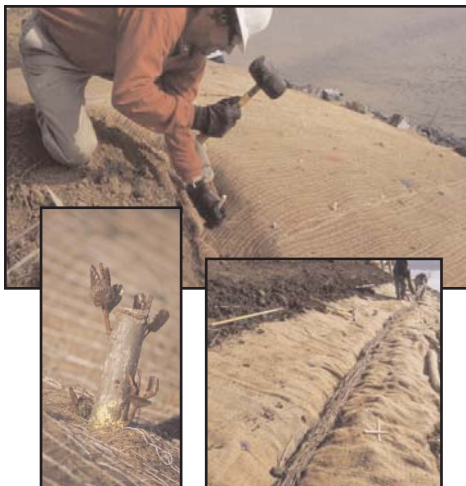
Installation of the C125BN (top) included an anchor trench at the top and hardwood EcoSTAKEs to secure the blanket. Fascines are placed in a trench on top of the blanket (right), and live stakes (left) begin to sprout leaves in only a few weeks.

cubic feet per second (cfs) to over 81,000 cfs, increasing the depth of water from 16.96 feet to over 30 feet and remained there for about 48 hours. This dramatic increase in erosive forces stressed the newly installed C125BN and the vegetation that accompanied it. However, by providing immediate coverage for the soil, the dense coconut fiber mulch and high strength nets of the C125BN were able to prevent soil loss from the bank, resist physical damage, and avoid the loss of any plant materials.