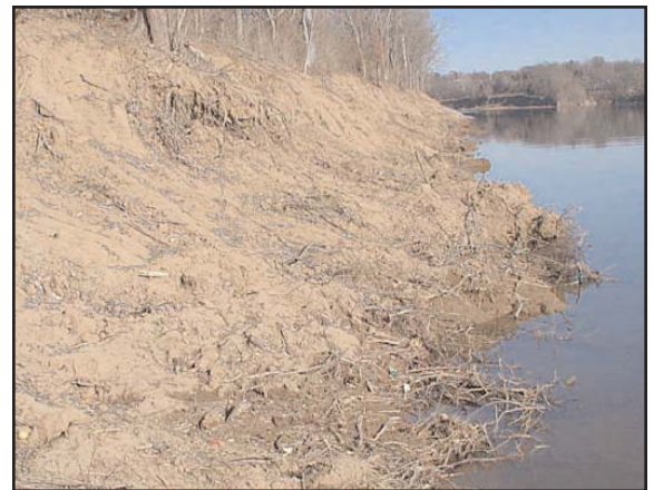
Eroded banks along the Cumberland River are unsightly and pollute the waterway.