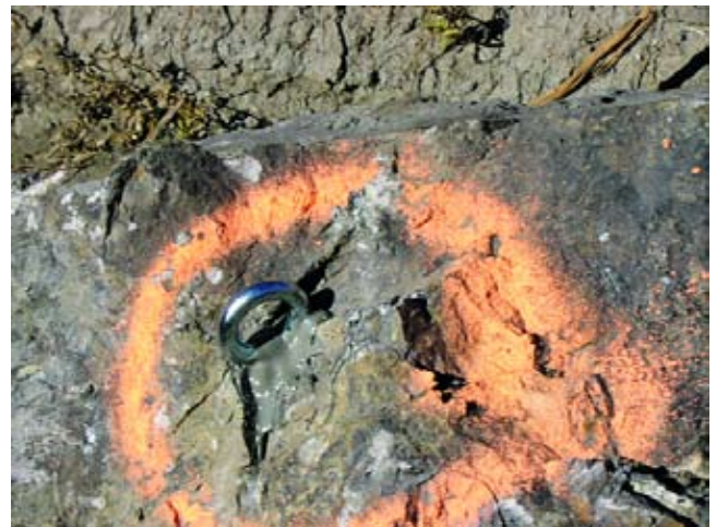
Figure TS14E-10 Wire rope anchored in boulder with epoxy