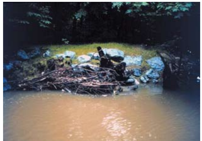
Figure TS14E-13 Debris lodged against rootwads

This factor is figured by estimating the percentage of voids in the surface area that are not anticipated to plug/fill with debris. Use conservative judgments when making this estimate. If method 1 is used to calculate the surface area, the permeability coefficient (K) is 1.0.