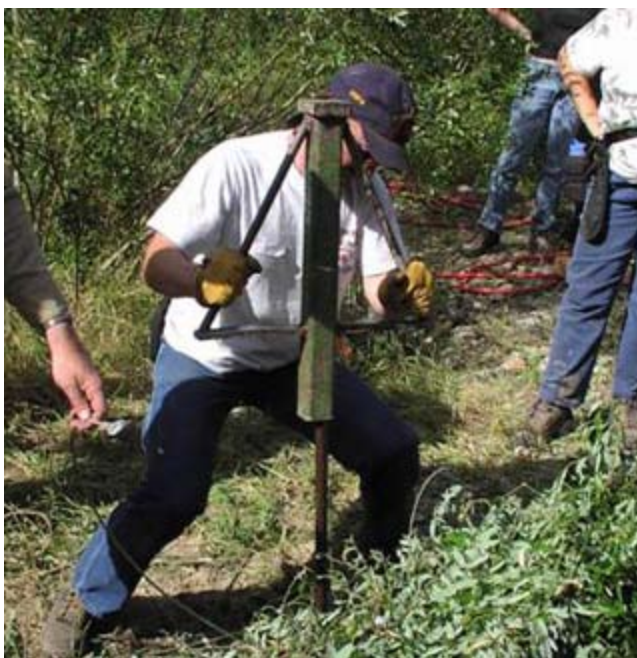
Figure TS14E-3 Post driver being used to install soil anchors