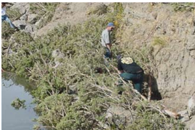
Figure TS14E-8 Boulders serve dual purpose: to stabilize the toe and secure brush revetment