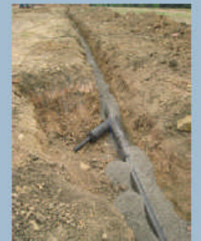
Methane Pipe Bedding/Seal